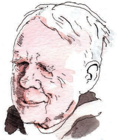
Robert Frost class of 1816 (1955)

"Always fall in with what you're asked to accept; fall in with it — and turn it your way."