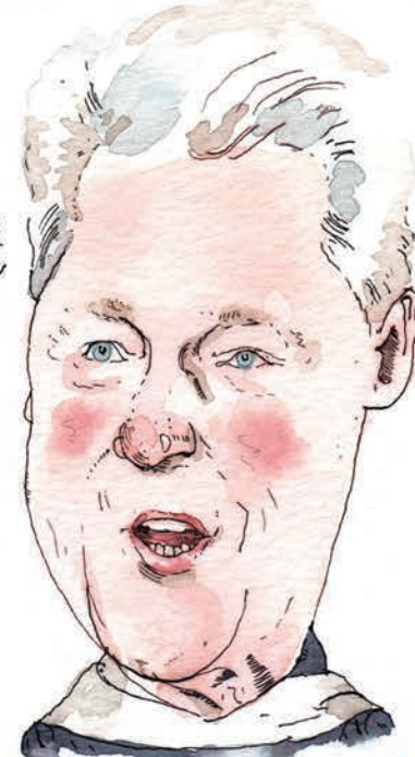
President Bill Clinton (1995)

"I hope you will be doers, not hearers only, and that when required you will indeed dare, as Dartmouth's motto suggests, to be voices crying the truth even in the wilderness."