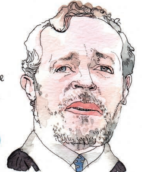
Robert Reich '68 (1994)

"At Dartmouth I learned how to learn. You have done the same, and there are few more potent skills."