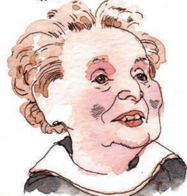
Madeleine Albright (2001)

"I envy you for things you will see and know that my generation never dreamed of."