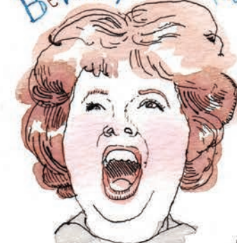
Beverly Sills (1985)

"If you are one of those people who like to get into the center of the ring and fight the bull in every sense of the word, I suggest you do it, because you can change the world."