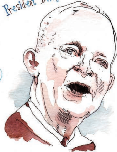
President Dwight D. Eisenhower (1953)

"Don't join the book burners. Don't think you are going to conceal faults by concealing evidence that they ever existed."