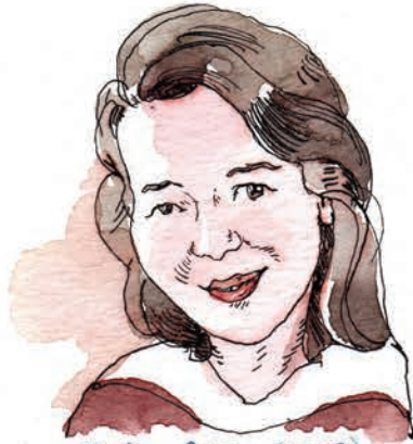
Louise Erdrich '76 (2009)

"If Harvard, Yale and Princeton are your self-involved, vain, name-dropping older brothers, you are the cool, sexually confident, lacrosse-playing younger sibling who knows how to throw a party and looks good in a down vest."