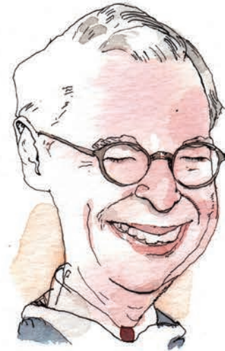
Fred Rogers '50 (2002)

"War is an act of despair; peace, of a song of and for hope."