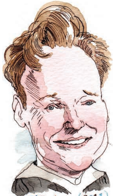
Conan O'Brien (2011)

Illustrations by Darry Blitt • Compiled by Minae Seog '14