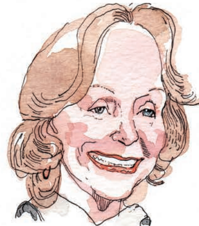
Doris Kearns Goodwin (1998)

"Deep down, we know that what matters in this life is more than winning for ourselves. What really matters is helping others win too."