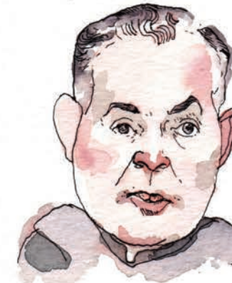
Rev. Theodore Martin Hesburgh (1958)

"The richest and fullest lives attain an inner balance of work, love and play, in equal order."