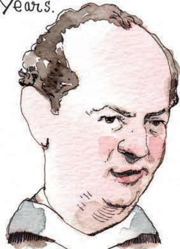
Sen. Bill Bradley (1987)

"No matter what we believe, no matter what our political convictions, ethnicities or religious faiths, we have to get together and steer this thing."