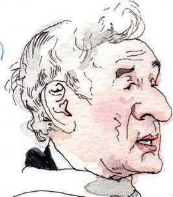
Elie Wiesel (2006)

"Money without purpose leads to an empty life. Technology without compassion and wisdom and a devotion to truth can lead to nightmares."